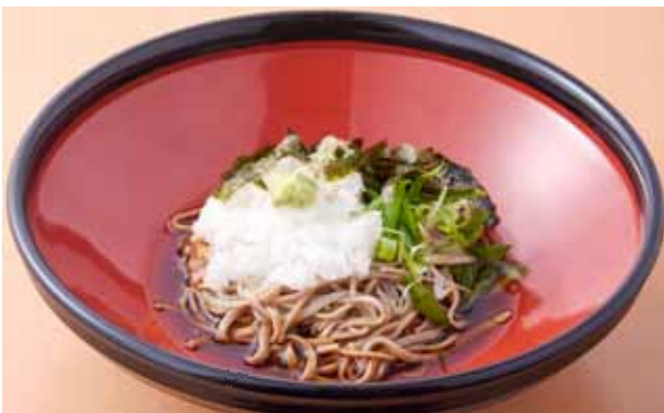
ぶっかけおろし蕎麦 . . . $12 Oroshi soba (Cold)