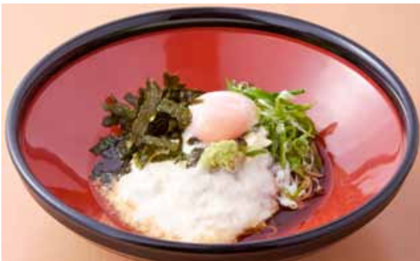
ぶっかけとろろ蕎麦 . . . $13 Tororo soba (Cold)