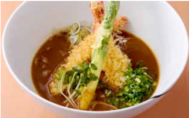
海老天カレー蕎麦 . . . $19 Curry soba with prawn tempura (Hot)

価格はそのまま蕎麦の量を100g・200g・300gよりお選び頂けます。 Please choose your preferred quantity of Soba 100g / 200g / 300g!