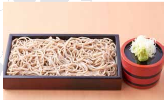
ざる蕎麦 . . . . . $10 Zaru soba (Cold)

Traditional Japanese Cold Soba dipped in Soba Sauce