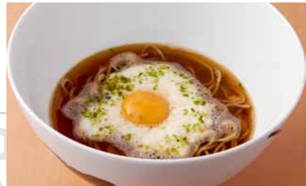
月見とろろ蕎麦 . . . . . $13 Tsukimi tororo soba (Hot)