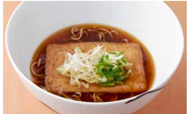
きつね蕎麦 . . . . . $12 Kitsune soba (Hot)